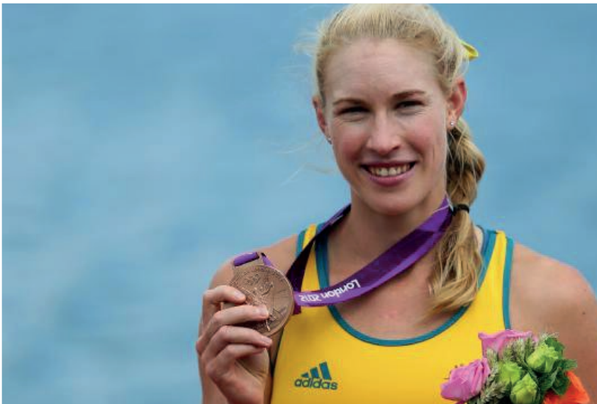
Kim Brennan - London 2012 Olympics