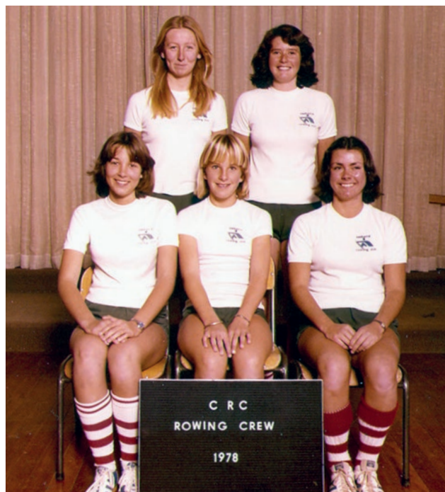
1978 Canberra Girls Grammar School crew

This formula had spectacular results seeing lightweight women from sporting backgrounds progress from beginners to national championship contenders in a few seasons. Crews coached by Bagnall and Wolf enjoyed local, state, and national success producing a stream of lightweight women champions and national team members. Acceptance of women members by Canberra RC from 1977 provided a long-awaited structure for inter-club competition with ANUBC. Canberra quickly built its numbers through active junior recruitment supplemented by rowers from interstate. Also, many Canberra Girls Grammar School students joined the Club as junior members.